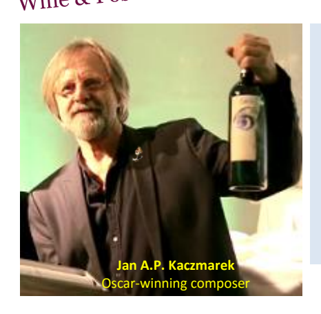
Wine & Poster Auction in aid of WWF •

5 beautiful WWF posters (signed by the CEO WWF UK David Nussbaum) with 5 bottles of the Cælestis Saint-Emilion Grand Cru Classé biodynamic wine vintage 2009 from the prestigious Château Fonroque) autographed by the Oscar-winning composer ('Finding Neverland') Jan A.P. Kaczmarek*: " Pure wine brings great inspiration to my music ". Both items are presented in an original wooden bookcase.